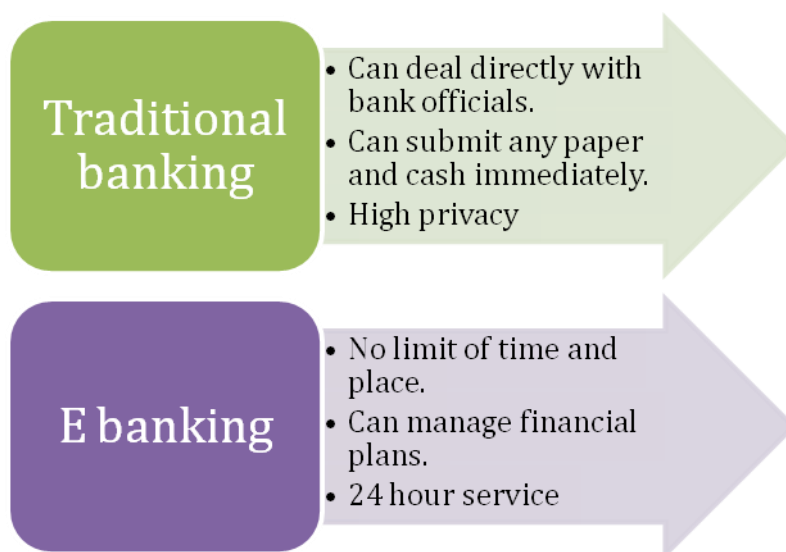
Figure 4: advantages of banks

Observing the services has been executed or planned for customer satisfaction identification of improving the scope of the services is very essential. Hammoud, Bizri and El baba (2018) stated that technological integration needs to be checked before integrating it for delivery. Review the security and make it updated from time to time so that any security weakness has not been developed for the electronic banking services (Rahi, Ghani & Ngah 2020). As per Asiyambi and Ishola (2018) mapping and integrating AI or different technological solutions need to be accustomed to the internal processing so that optimized satisfying services can be developed for the customers. Banking services can be more sustainable by applying ESG practices relevant to banking industry (Kumar, S., Baag, P.K. and Shaji, K.V., 2021).