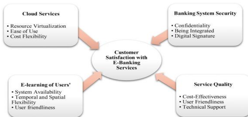
Figure 2: Customer satisfaction with bank services